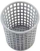
Cutlery Round Basket