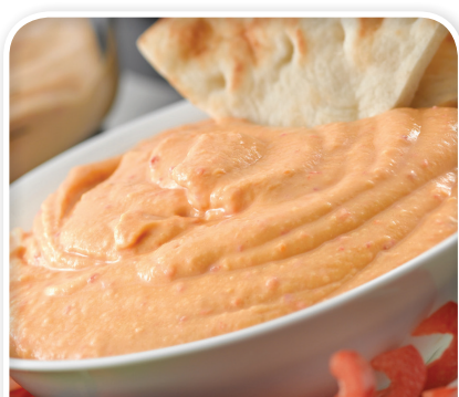
Blend hot and cold ingredients