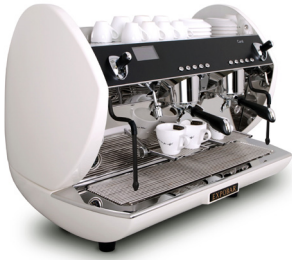
Carat Eco Display 2GR white