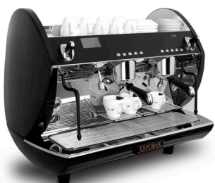
Carat Eco Display 2GR black