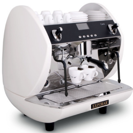
Carat Eco Mini Display IGR white