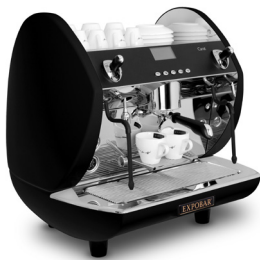
Carat Eco Mini Display IGR black